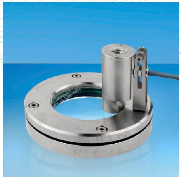
Lumistar luminaire ESL 51LED KS adapted to a standard flange