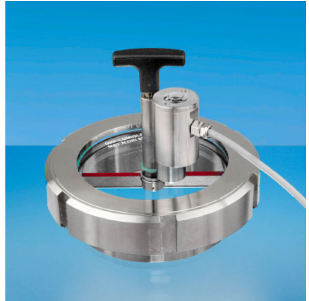
Lumistar luminaire ESL 51LED HK installed on a screwed sight glass fitting equipped with Lumiglas wiper unit SW 1

The luminaire is fixed to the mating flange by a hinged bracket in the case of circular sight glass fittings and visual flow indicators. With screw-type sight glass fittings, it is fastened to the groove nut